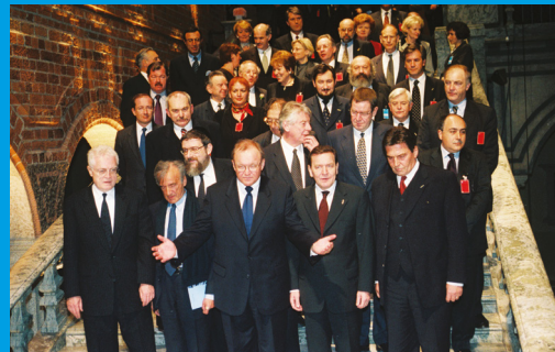
Heads of State at Stockholm Int. Forum on the Holocaust

Persson initiated the Stockholm International Forum on the Holocaust which took place from 26 – 28 January 2000 and was attended by high-level representatives from 48 countries. It was the first international political forum on Holocaust education, remembrance and research.