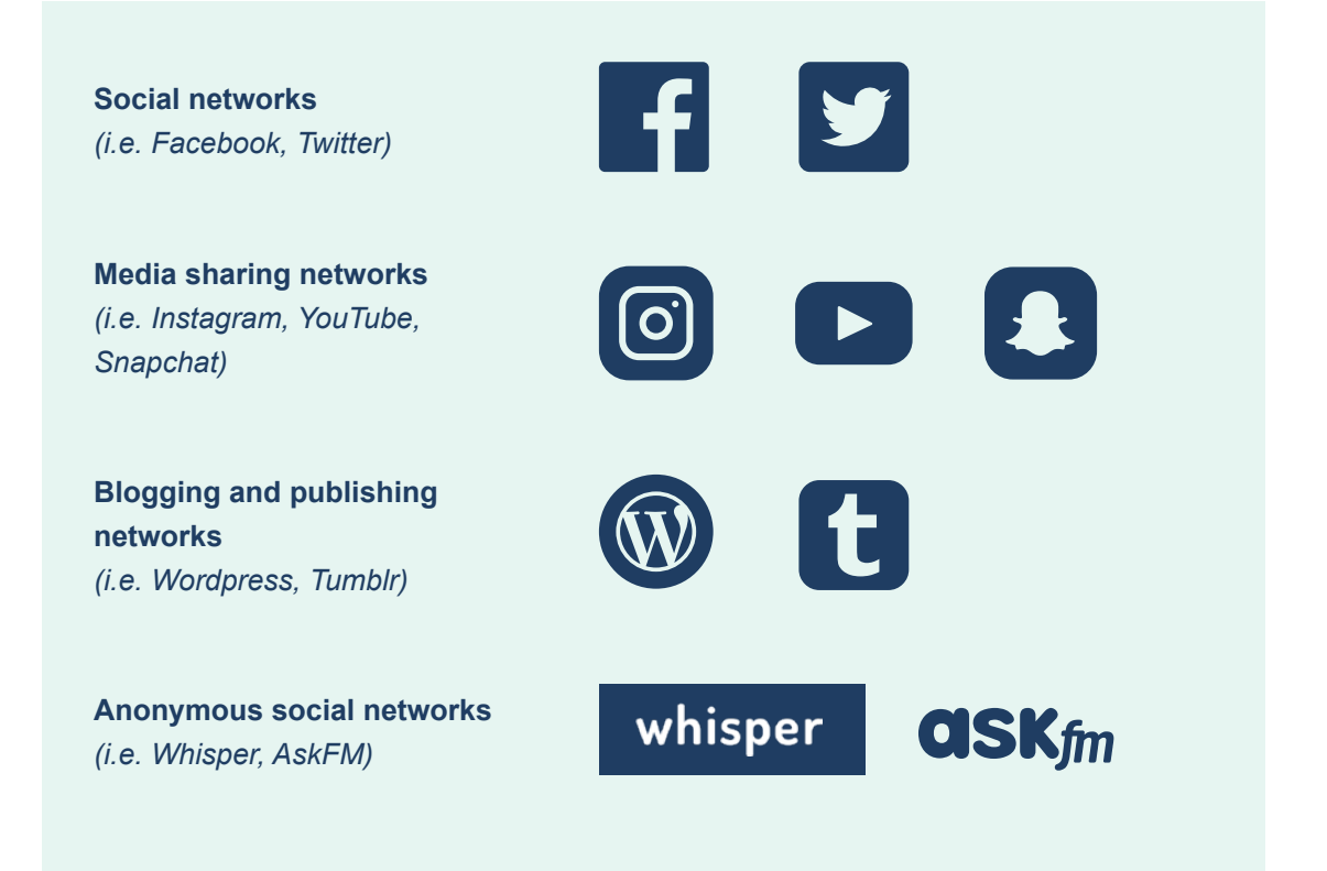
Figure 4. Some examples of social media

It can also be useful to identify different categories of social media, and discuss how they work, what the audience is, and why people use them. Social media includes: