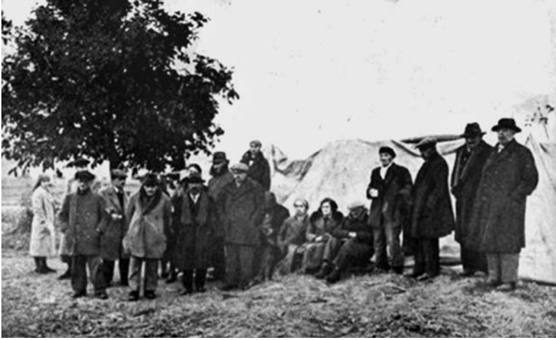
“The Jewish Refugees from Germany in Zbasyn” in Olami , Tarbut school publication (21 November 1938)